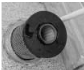
Figure 19 Checking lower O-ring seal